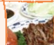
31 Mongolian Aromatic Lamb