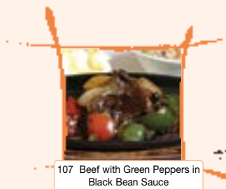
107 Beef with Green Peppers in Black Bean Sauce