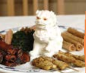
1 House Hot Hors D'oeuvres