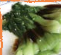
167 Stir-Fried Seasonal Chinese Vegetables