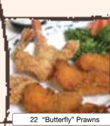
22 "Butterfly" Prawns