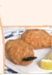
19 Stuffed Crab Claw