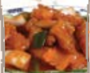
139 Sweet & Sour Chicken "Hong Kong Style"