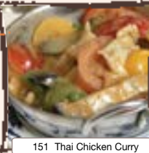
151 Thai Chicken Curry