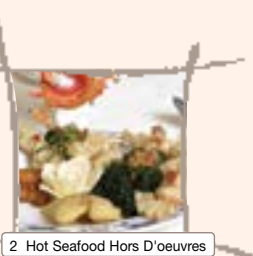
2 Hot Seafood Hors D'oeuvres