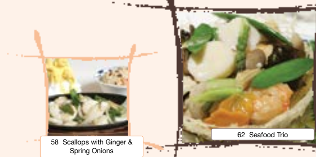
58 Scallops with Ginger & Spring Onions