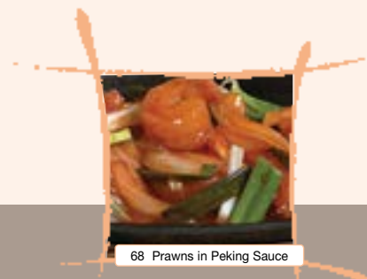
68 Prawns in Peking Sauce