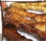
3 Grilled House Satay