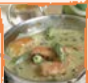
152 Green Thai Prawn Curry