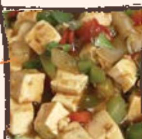
153 Ma Po Beancurd