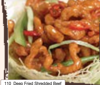
110 Deep Fried Shredded Beef with Chilli