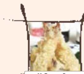
26 Tempura Prawns